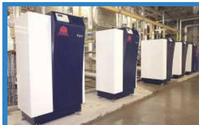
Plant room at The Little Sisters of the Poor new Holy Rosary elderly care residence in Greenock where two Andrews R303 condensing water heaters are sited side-by-side with three Andrews R306 condensing boilers, installed by James Frew Ltd. for Main Contractors, Kier Scotland.

However, as the requirement for space heating in the UK diminishes, the demand for hot water heating shows no signs of reducing. Figure 1 below shows one plausible scenario based on the argument presented in this article. How long will it be before this becomes a reality?