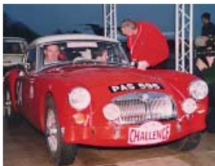
The Andrews sponsored entry at the start of the Winter Challenge to Monte Carlo.